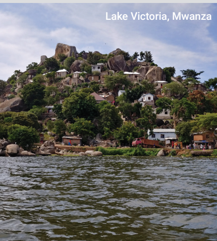
Lake Victoria, Mwanza

“Education is the key to unlocking the world, a passport to freedom. ~Oprah Winfrey”