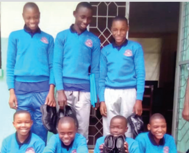
Year 1 students in Mwanza - new uniform, new shoes!

25 students in high school, 56% girls, 44% boys